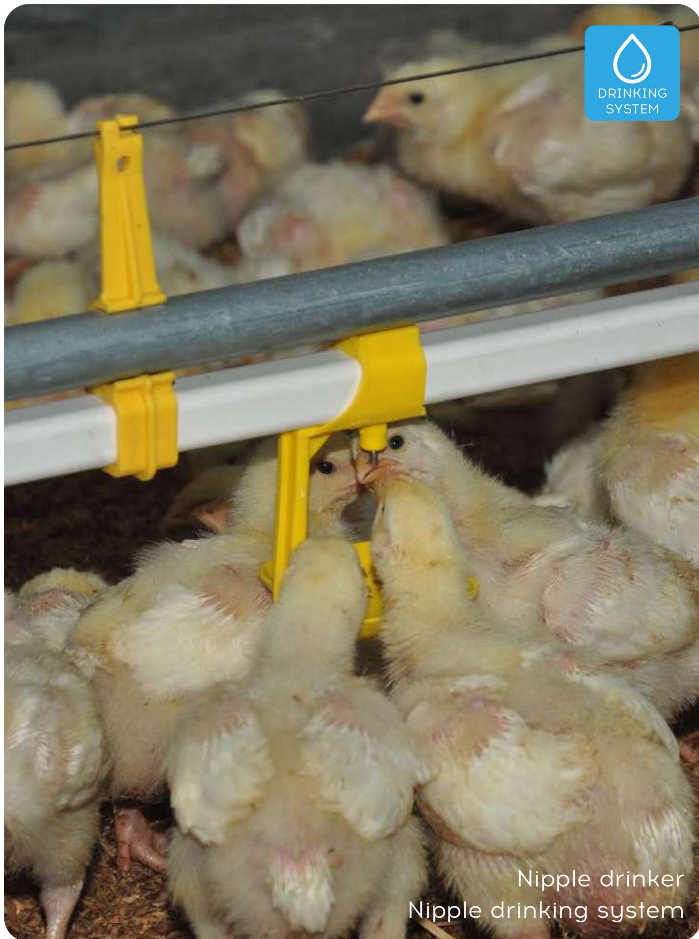
Nipple drinker Nipple drinking system